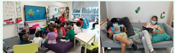
Flexible classrooms: Georges P.-Vanier, La Rose-des-Vents and Saint-Laurent elementary schools