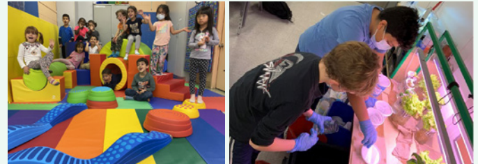
Samuel-De Champlain school – Kindergarten classroom for 4 year-olds and hydroponic garden